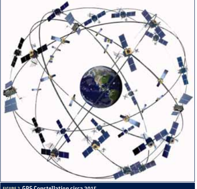
FIGURE 2 GPS Constellation circa 2015

designed to be interoperable with international global navigation satellite systems (GNSS).