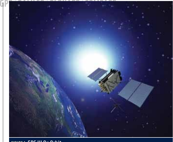
FIGURE 1 GPS III On Orbit

The first GPS III satellites will deliver signals three times more accurate than current GPS spacecraft and provide three times more power for military users. They will also increase the SV design life to 15 years and add a new civil signal