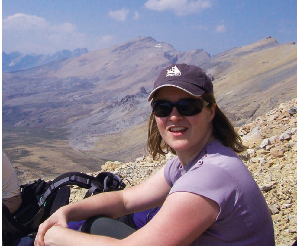
Hiking in the Canadian Rockies near Banff

Since her husband, his father, and his brother are also engineers, an engineering mindset tends to be the norm in her non-working life as well.