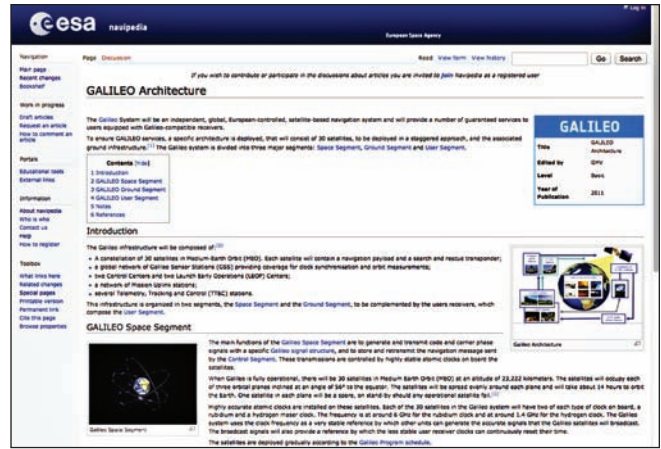
FIGURE 3 Galileo architecture