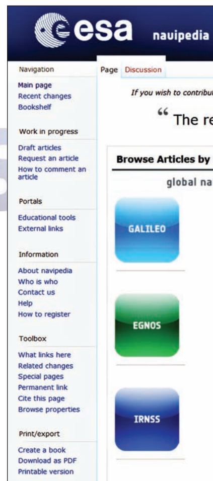
FIGURE 2 Sidebar detail.

official pages of each of the systems), GNSS-specialized educational tools, and relevant documentation.