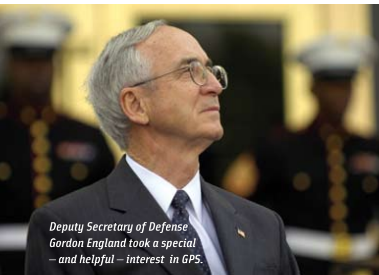
Deputy Secretary of Defense Gordon England took a special — and helpful — interest in GPS.